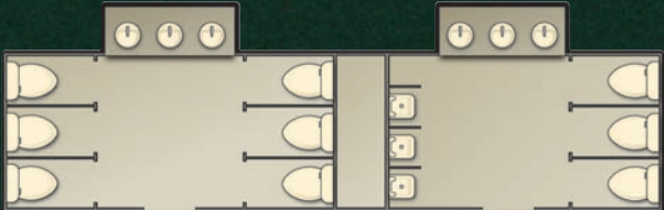
32' Large: 12 facilities (6 women, 6 men)