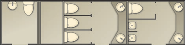
32' ADA Combo: 7 facilities (3 women, 3 men, 1 ADA toilet and lavatory)