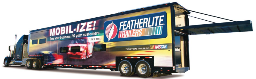
Trailer powered by a KOHLER 30 kW diesel generator

Available in 10-15 kW at 60 Hz, KOHLER gasoline generators offer heavy-duty power in a lightweight package. These little powerhouses are built to be quiet and compact, with minimal vibration.