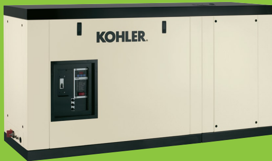
40 kW Diesel Generator with Optional Sound Enclosure Model: 40EORZDB