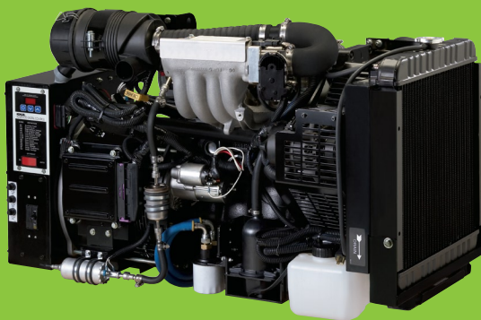
13 kW Gasoline Generator Model: 13ERG